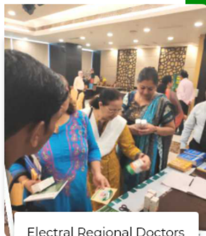
Electral Regional Doctors Conference